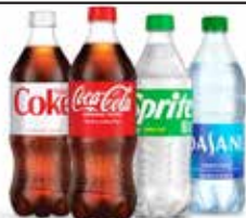
BOTTLED DRINK BUNDLE 4 Bottled Beverages