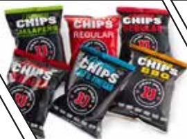
CHIPS BUNDLE 6 Jimmy Chips