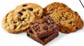
DESSERTS BUNDLE 6 Desserts